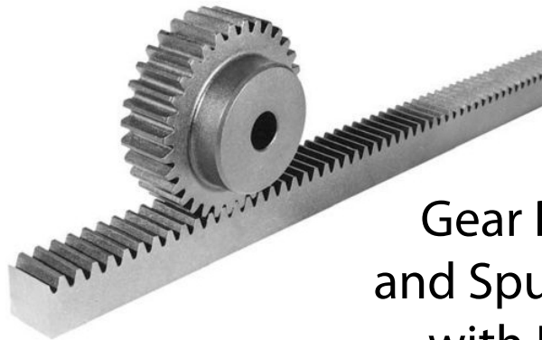
Gear Rack and Spur Gear with Hub